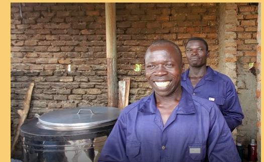
School kitchen and staff

St. Max Twinning Ministry wants to help 50 of the poorest students of St. Patrick's in their desire for a better life. The cost to support a student is approximately $300 per student annually. Families will supply their children with uniforms, books and materials for their part. Please consider partnering with us to make a difference in the lives of these children. Your generosity and commitment to see a child complete their education will change a life. May the Lord guide your giving as you pray!