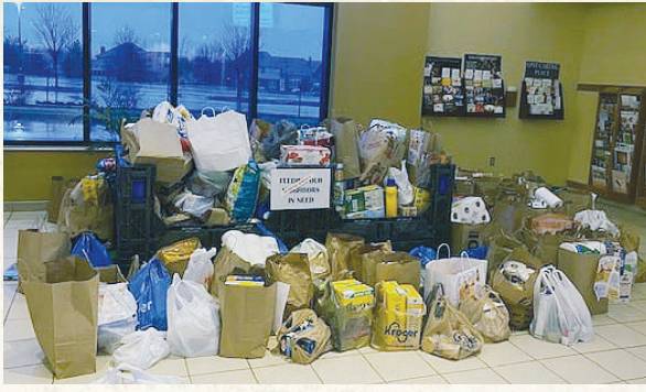
TOP St. Max participated in Faith Alliance Xdays, a community service day. BOTTOM St. Max collected just short of 4000 lbs. this past Lent for Faith Alliance's Feed Our Neighbor campaign which went directly to Reach Out Lakota!