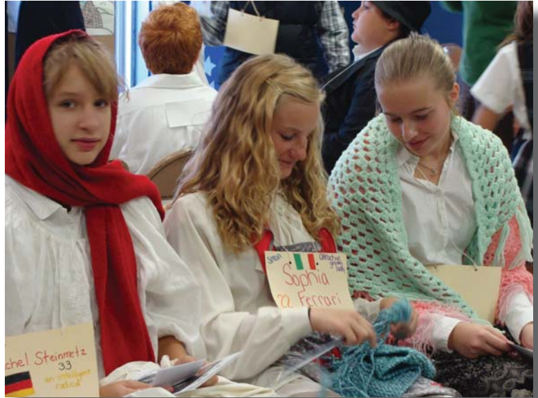
Students participate in History Week activities.

The following week's book fair encouraged students and parents to add to their collection of books for personal reading as well as to take advantage of potential Christmas gifts and