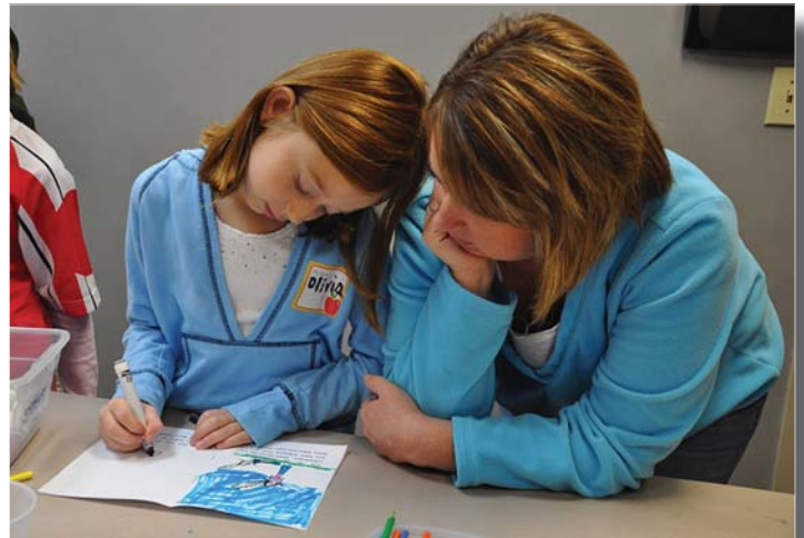
Mom and daughter discussing and illustrating the Reconciliation Booklet.